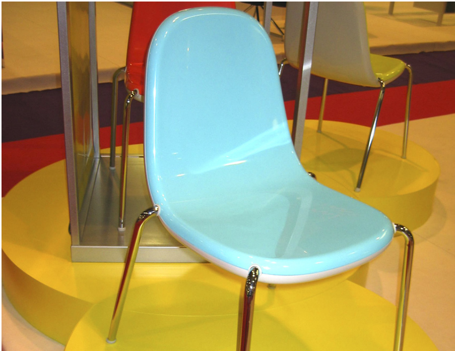
Magis' Aqua plastic chair