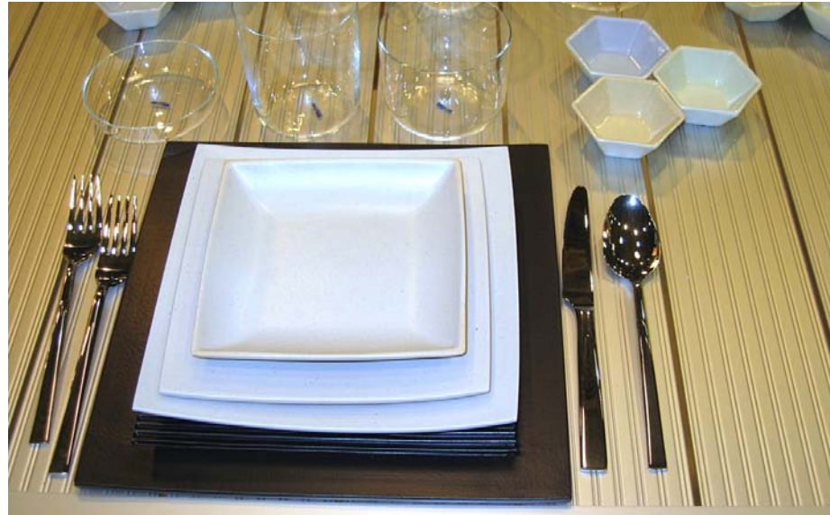
Putty plus tinted neutrals: Triade Kosmo