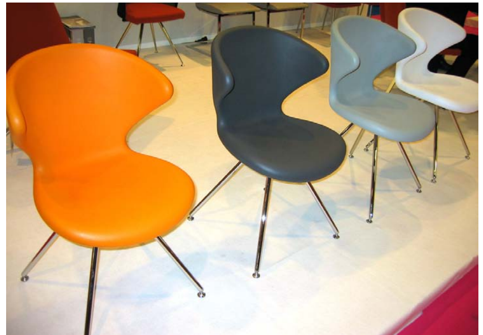
Tonon's chairs in Yellow-cast Orange, Graphite, Aluminum and White