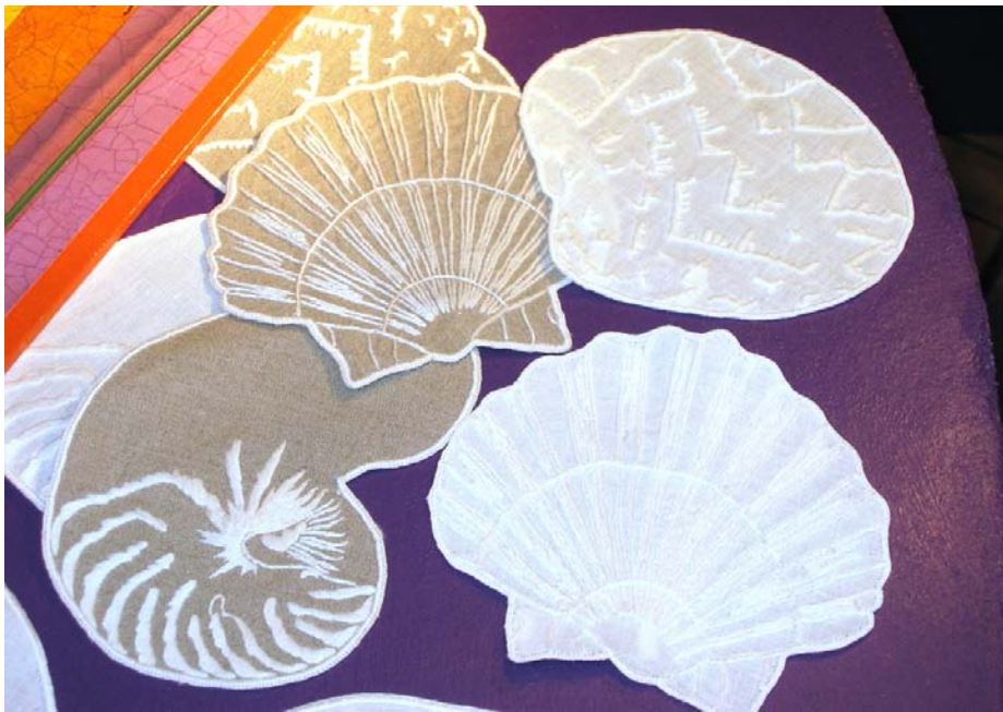
Shell shapes in linen for the table done in neutrals from Siècle