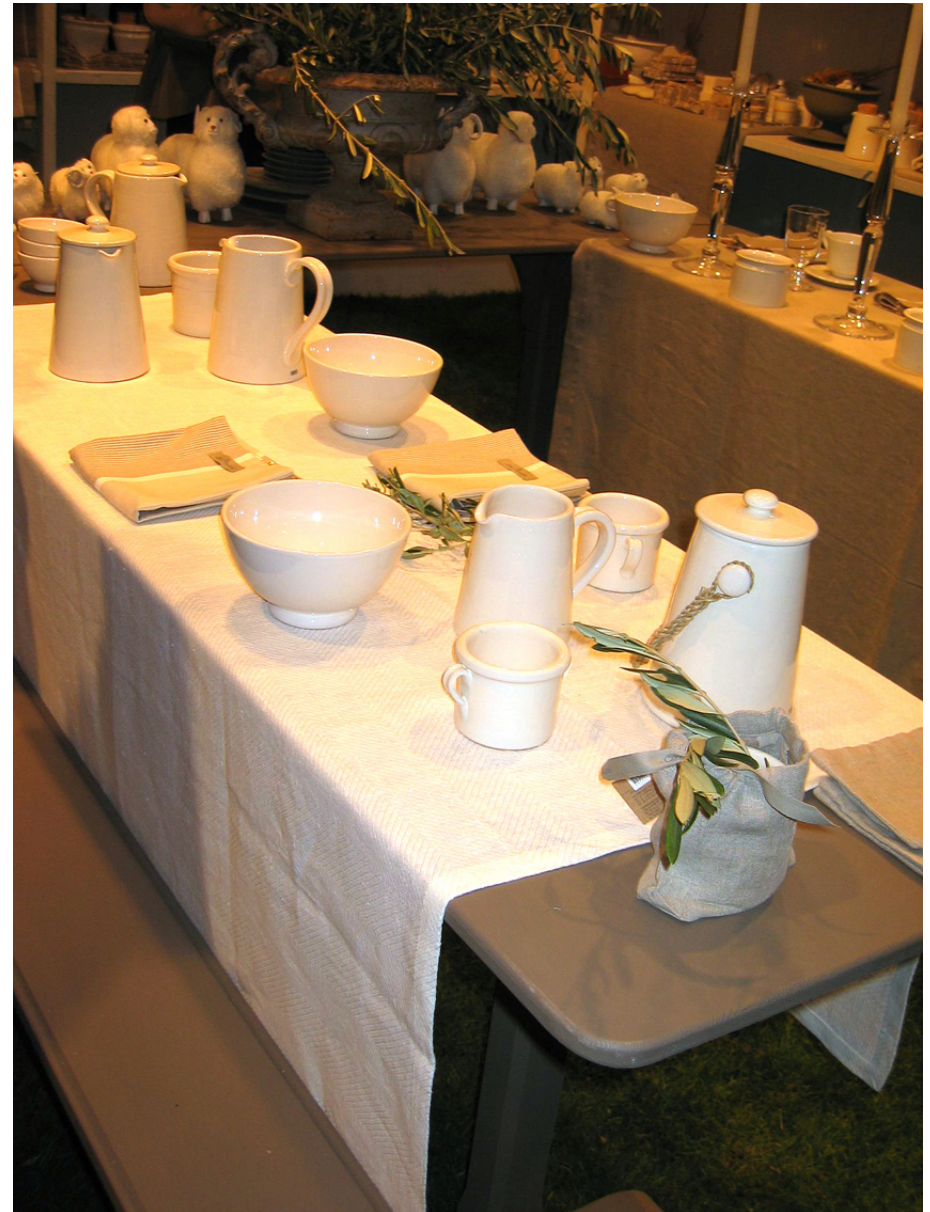
At Cote Bastide, a neutral tablescape in linen fabric and creamware