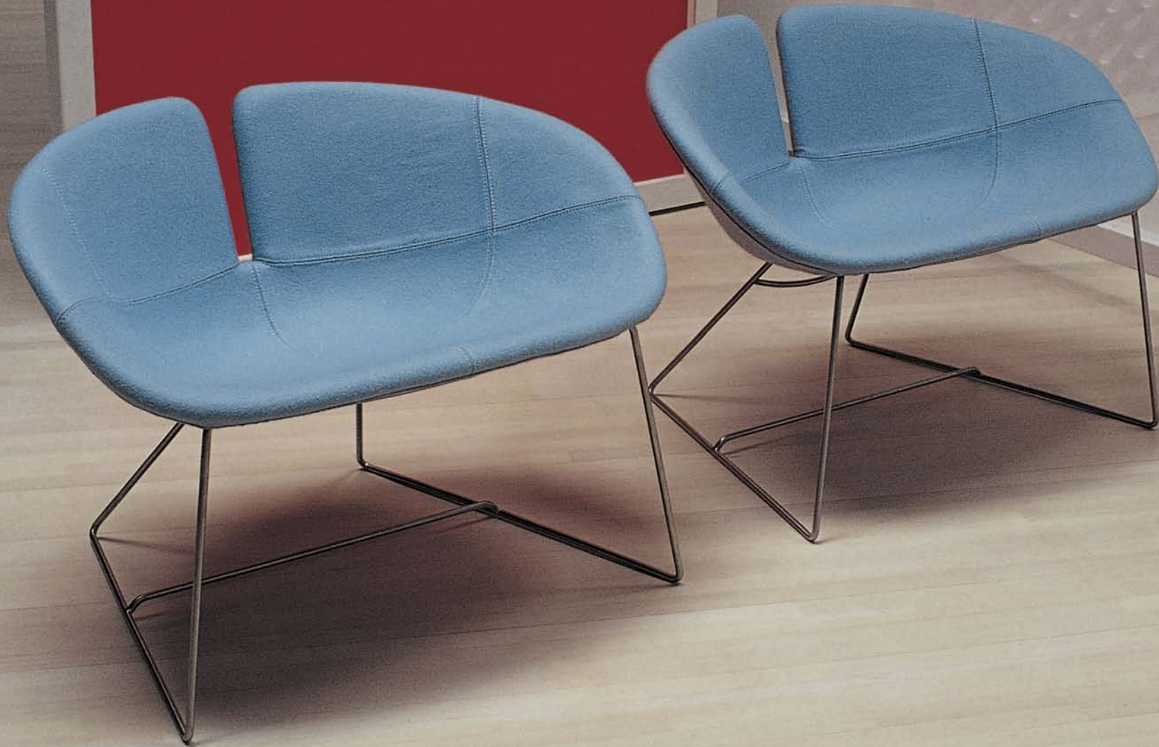
Contemporary Design by Moroso