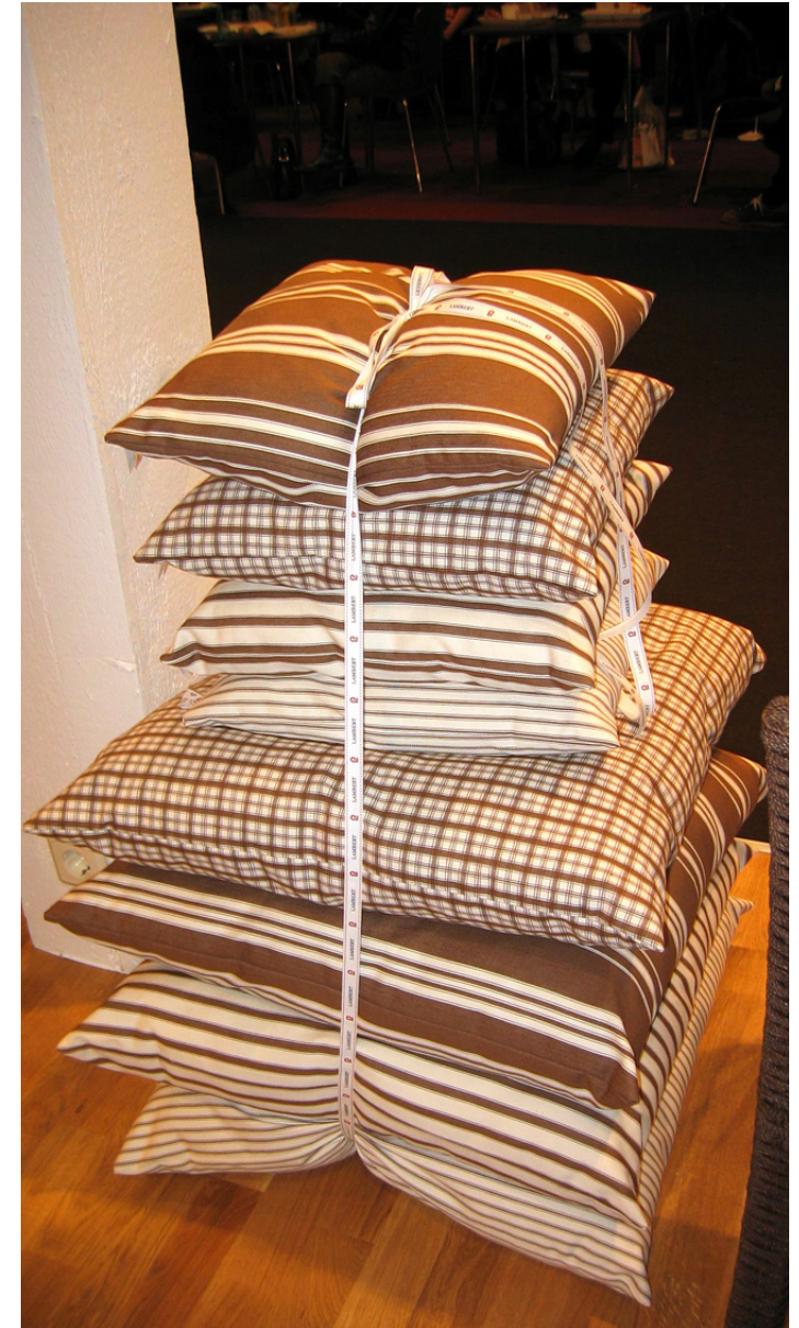
Elite Brown plus neutral in Lambert's stripes and plaids