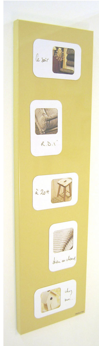
White and Camel in a magnetic frame concept from Presse Citron