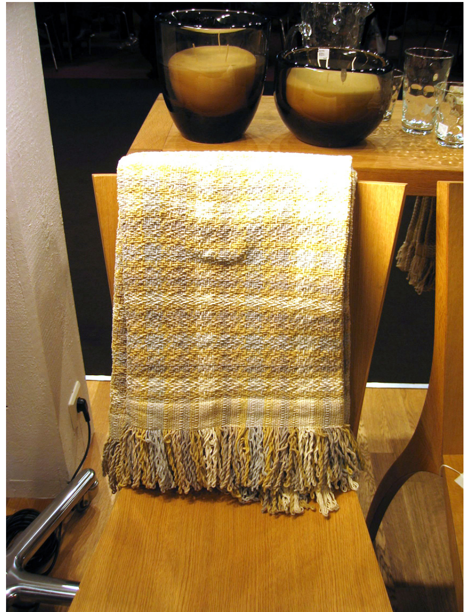
Off-White, Camel and Gray at Lambert