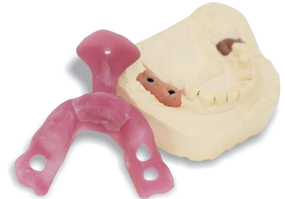
Custom tray for implant impressions